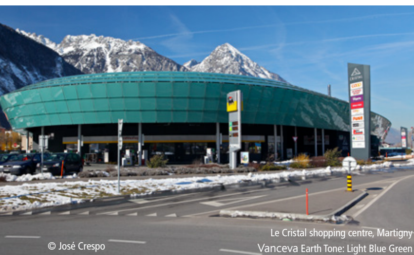
Le Cristal shopping centre, Martigny Vanceva Earth Tone: Light Blue Green