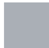
Medium Blue Grey

To resist fading, these PVB films are made with heat- and light-stable colorants. As a result, they are ideal for both interior and exterior applications, including balconies, curtain walls, atriums, skylights, partitions, and conference rooms.